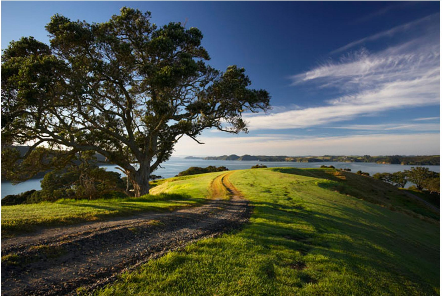
North View – Top Paddock